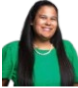
Amber Marshall Education Task Force